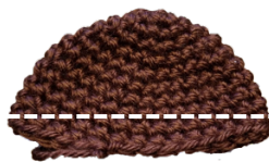
Brim Length about 3 ¾ - 4 inches