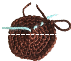
Crown about 2 ½ inches