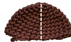
Crown to Brim Length about 2 – 2 ¼ inches