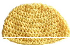
Brim Length about 5 - 5 ½ inches