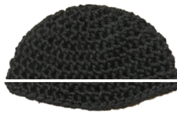
Brim Length about 5 - 5 ½ inches