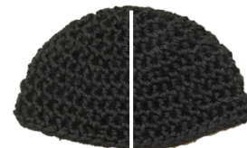
Crown to Brim Length about 3 inches