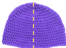
Crown to Brim Length Approximately 7 inches