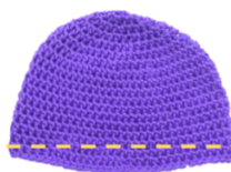
Brim Width 8 ½ – 9 ¼ inches